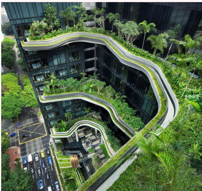
PARK ROYAL COLLECTION ON PICKERING HOTEL, SINGAPORE

For a clearer pathway to this vision, the Singapore Hotel Association and STB introduced the Hotel Sustainability Roadmap in 2022. Aligning with global sustainability aims, this roadmap emphasizes a gamut of areas, from water conservation to sustainable sourcing. Its ambitious goal: ensure 60% of hotel rooms gain international sustainability certifications by 2025.