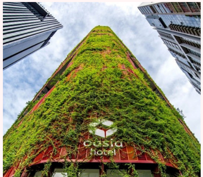
OASIA HOTEL, DOWNTOWN

Traveler trends also underscore the importance of sustainability. A WGSN report highlighted the rise of 'Mindful Explorers' - tourists keen on sustainable choices. Notably, in 2022, top spenders from countries like Indonesia and India showed a strong preference for eco-friendly accommodations, affirming sustainability's crucial role in shaping global travel trends.