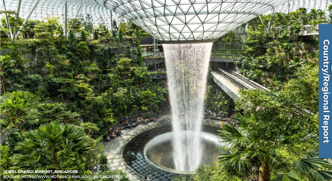
JEWEL CHANGI AIRPORT, SINGAPORE