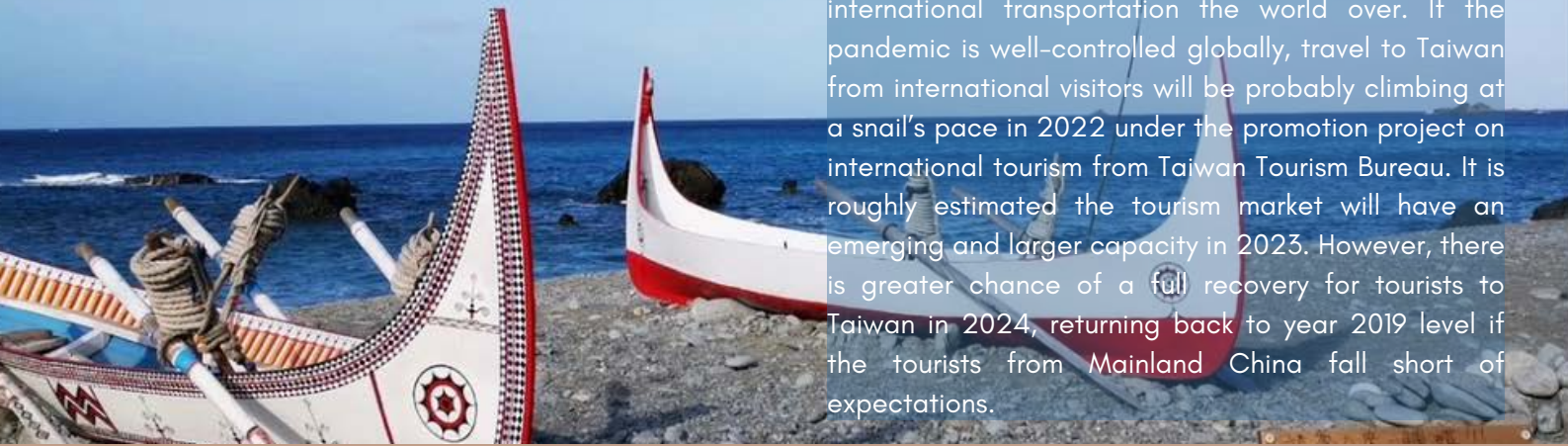
BEAUTIFUL CARVING BOAT AT ORCH

The widespread outbreak of pandemic of COVID-19 in early 2020 has damaged the global economy, causing not only inbound and outbound travel restrained by Taiwan's Tourism Bureau, but also strict controls on visitor's immigration procedures and international transportation the world over. If the pandemic is well-controlled globally, travel to Taiwan from international visitors will be probably climbing at a snail's pace in 2022 under the promotion project on international tourism from Taiwan Tourism Bureau. It is roughly estimated the tourism market will have an emerging and larger capacity in 2023. However, there is greater chance of a full recovery for tourists to Taiwan in 2024, returning back to year 2019 level if the tourists from Mainland China fall short of expectations.