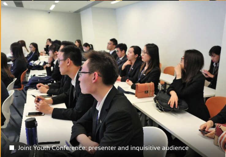
■ Joint Youth Conference: presenter and inquisitive audience