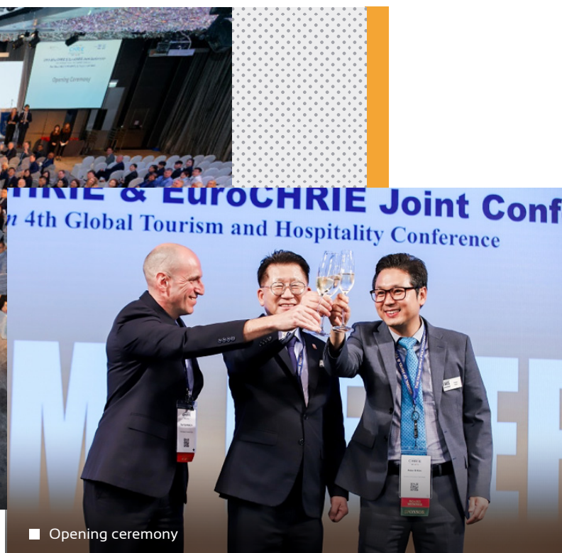
■ Opening ceremony