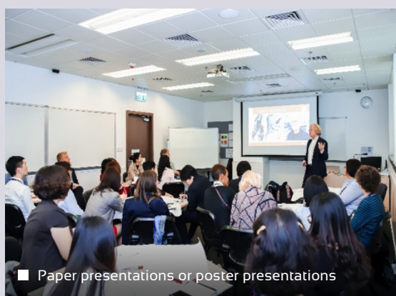
■ Paper presentations or poster presentations