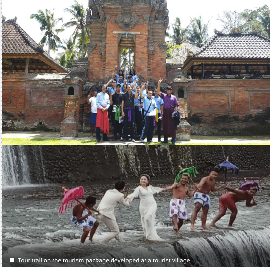
■ Tour trail on the tourism package developed at a tourist village