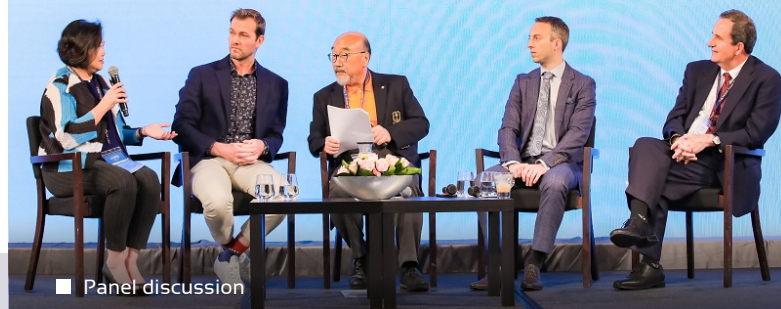
■ Panel discussion