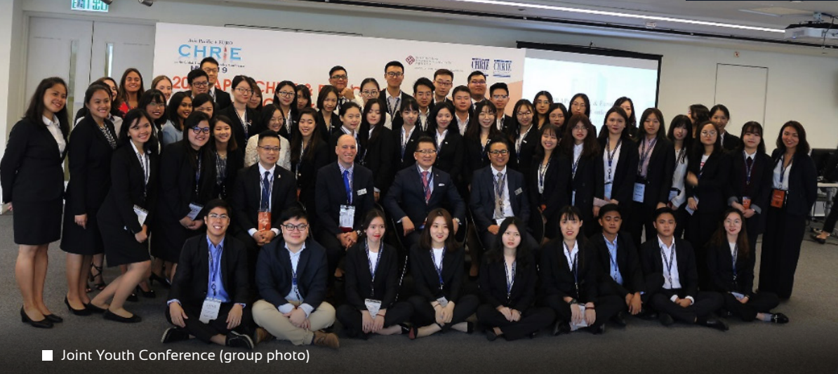
■ Joint Youth Conference (group photo)