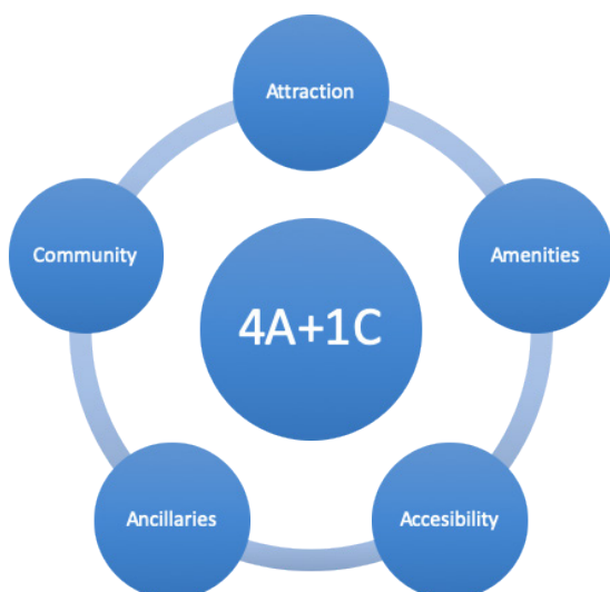
Figure 2. Tourist Village Development Criteria

The roles of academicians (lecturers and students) in this project are primarily to promote the residents' competency in managing a tourist village and the village's tourism products. This is known as an "accompaniment" program. Academicians make sure that the tourist villages' development complies with the sustainability development principles that are applicable, and that the villages' tourism development is economically, environmentally, socially, and technologically feasible. Evaluations will be conducted to assess the application level of the program, obtain feedback for further development planning, and propose scoring for the Tourist Village Competition.