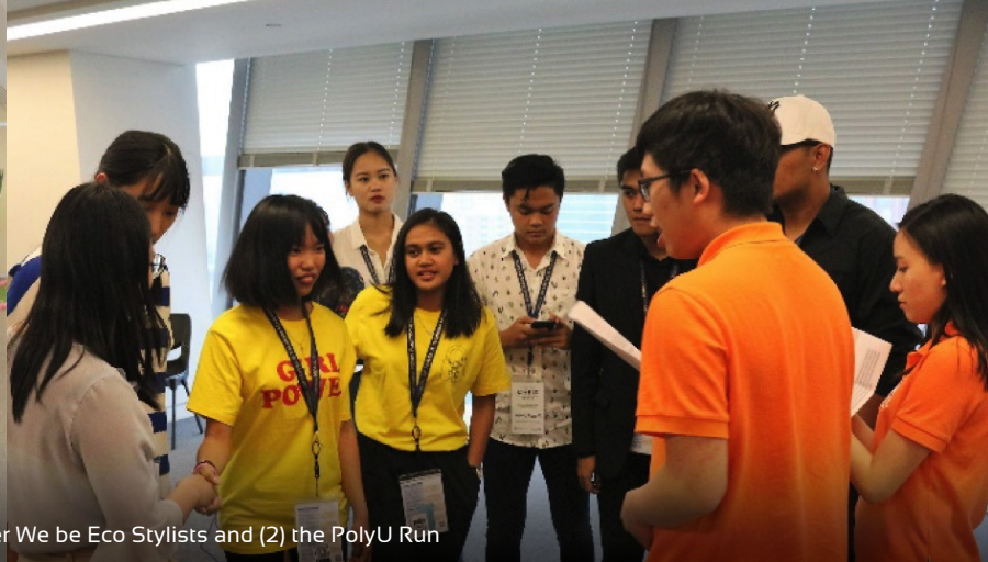
■ Joint Youth Conference, leadership & cultural activities: (1) Together We be Eco Stylists and (2) the PolyU Run