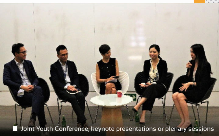
■ Joint Youth Conference, keynote presentations or plenary sessions