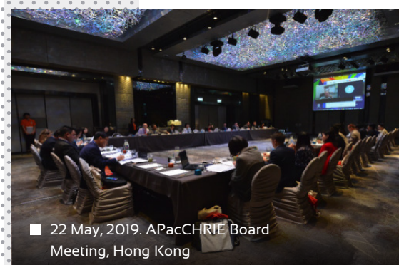
■ 22 May, 2019. APacCHRIE Board Meeting, Hong Kong