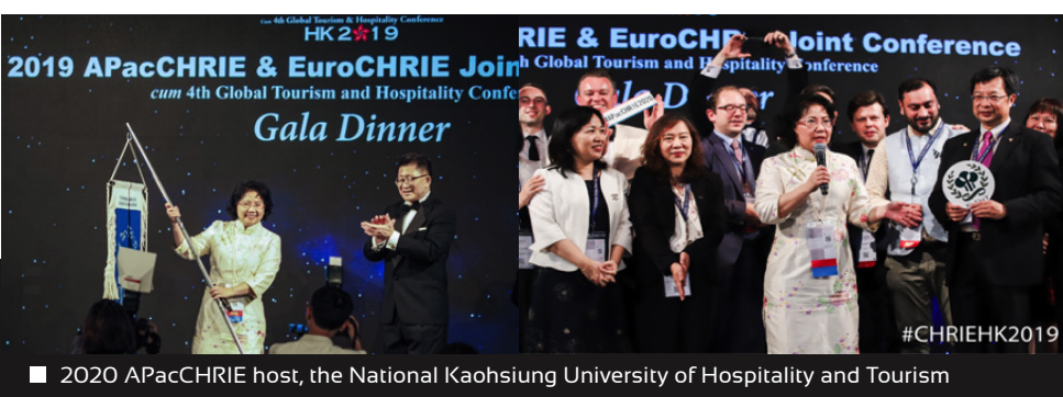
■ 2020 APacCHRIE host, the National Kaohsiung University of Hospitality and Tourism