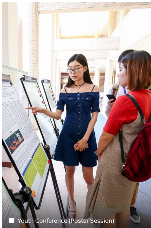
■ Youth Conference (Poster Session)