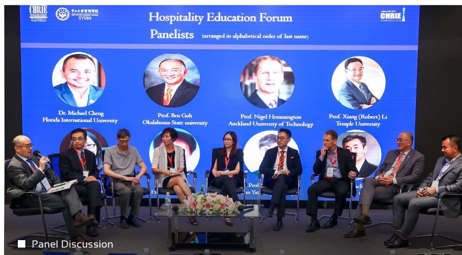
■ Panel Discussion