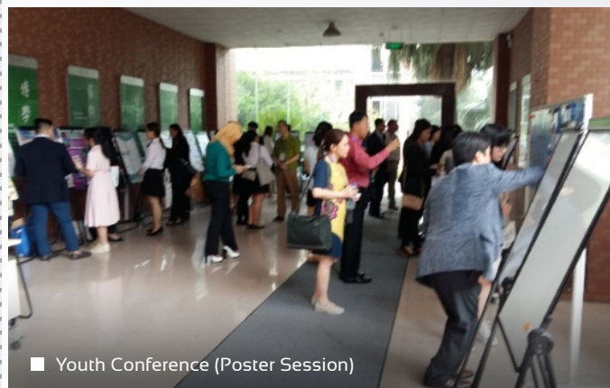
■ Youth Conference (Poster Session)