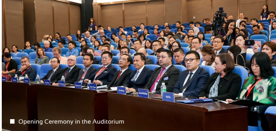
■ Opening Ceremony in the Auditorium