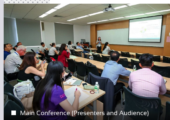
■ Main Conference (Presenters and Audience)