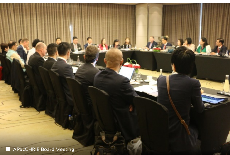
■ APacCHRIE Board Meeting