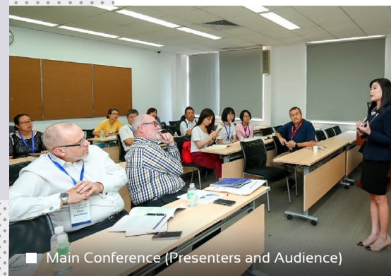
■ Main Conference (Presenters and Audience)