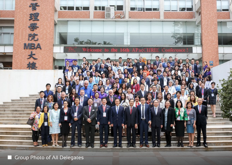
■ Group Photo of All Delegates