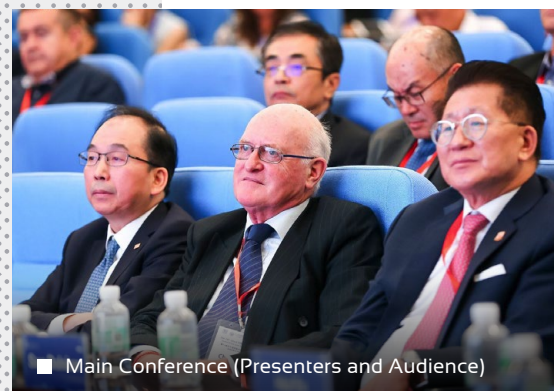
■ Main Conference (Presenters and Audience)