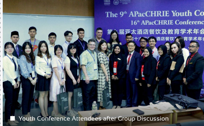
■ Youth Conference Attendees after Group Discussion