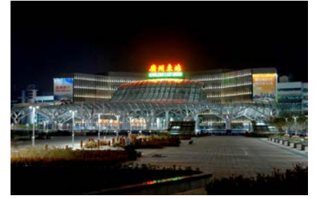
GZ East Railway Station / 广州东站