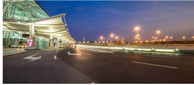
GZ Airport/ 广州白云机场