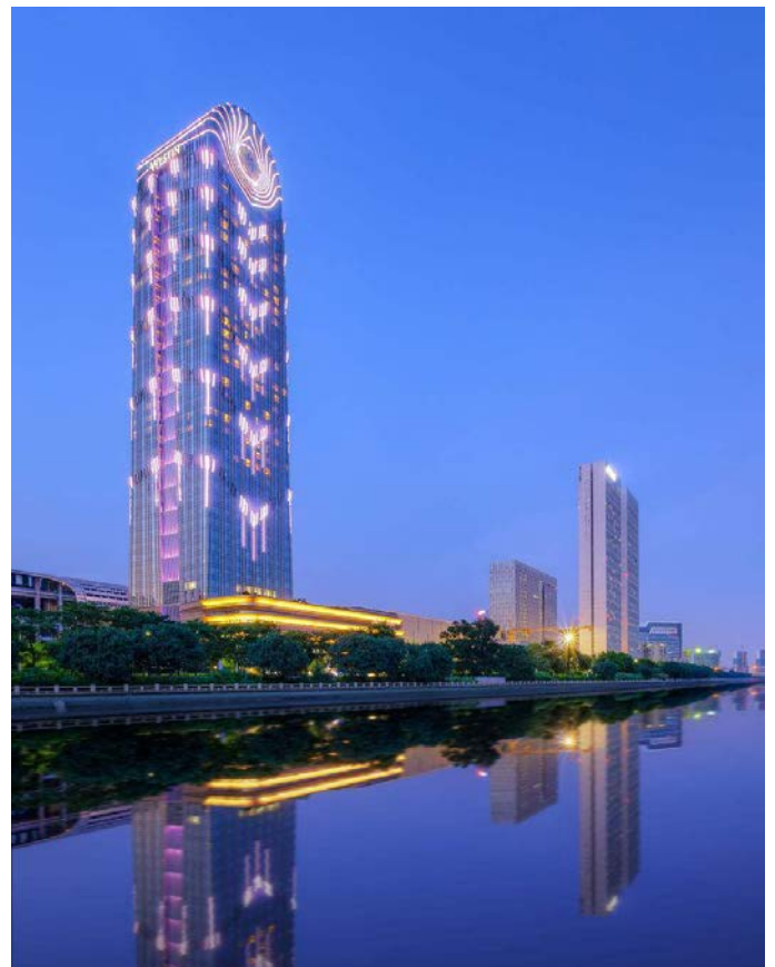
中大凯丰酒店 (中大学人馆) Kaifeng Hotel