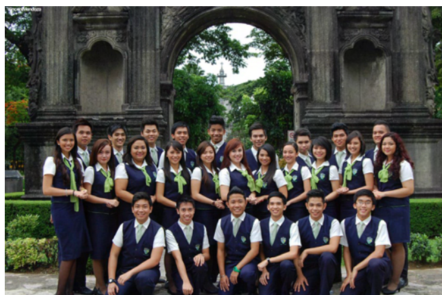
OATHS 2012 Student Organizers