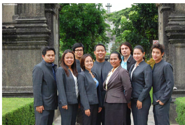
OATHS 2012 Faculty Advisers