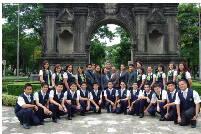
OATHS 2012 Student Organizing Committee