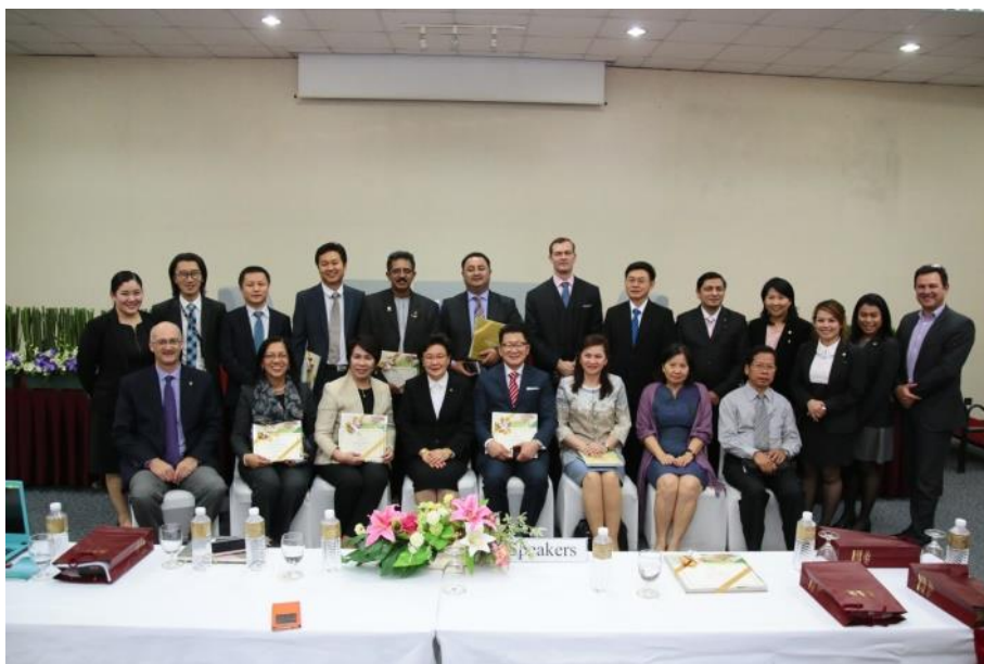
Dusit Thani College Organizers with APacCHRIE Board