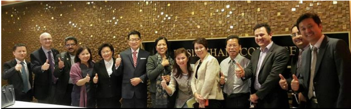
APacCHRIE Board shows a sign of approval for the Dusit Thani College Forum and Facilities

The board also experienced Thai hospitality of DTC with the Chinese Lauriat Lunch, Vietnamese dinner and the international buffet spread for the board meeting. The APacCHRIE Forum that is scheduled a day before the January board meeting has been a great opportunity for board members to share their experiences and knowledge with the conference host school, and has been practiced for a number of years already.